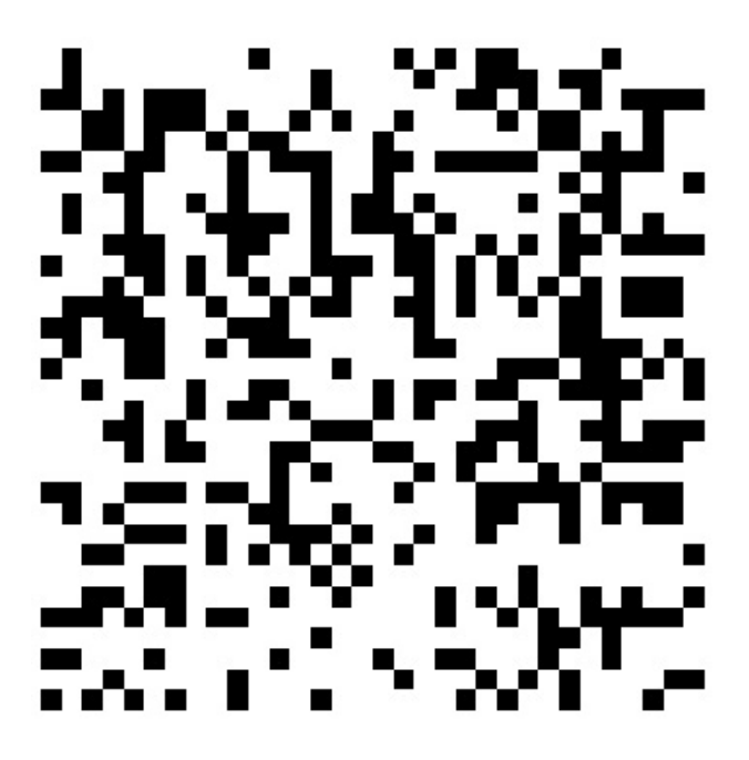
Figure 3: Encrypted image.